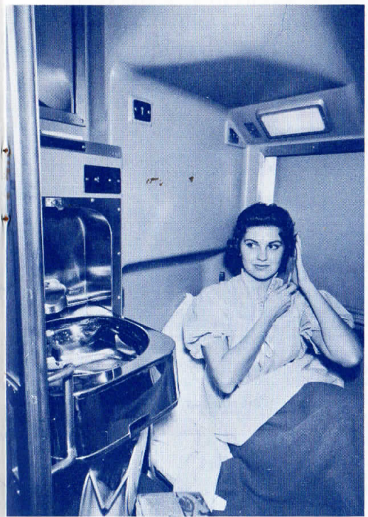
Slumbercoaches offer private room sleeping accommodations at economical coach prices plus small room charge.