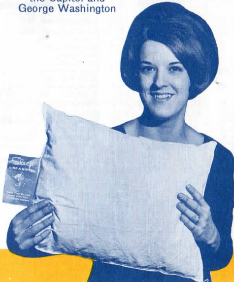
Complimentary souvenir pillows on most overnight trains