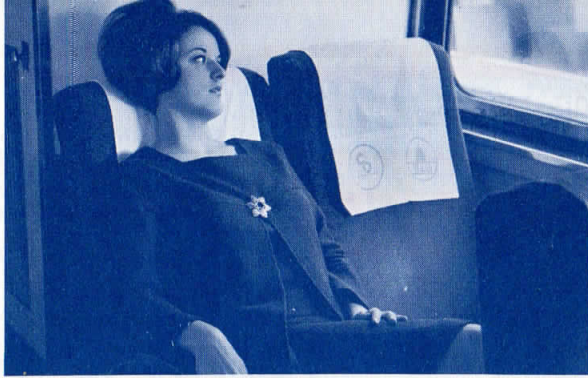
Relax in a comfortable reclining seat coach