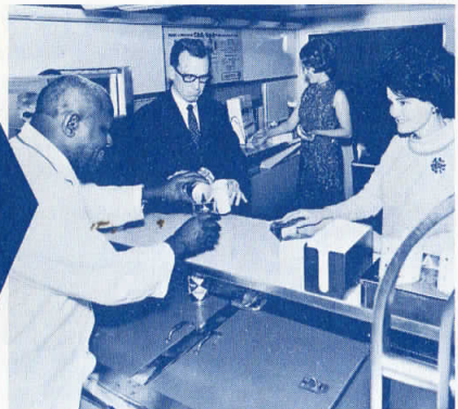
"Iron Horse Tavern"—popular spot for beverages and snacks on the Capitol