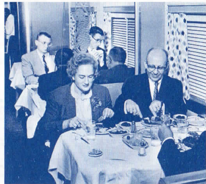
Superb dining aboard the Capitol and George Washington