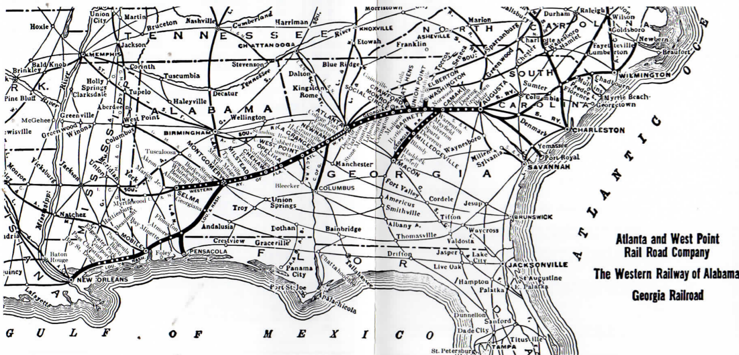
Atlanta and West Point Rail Road Company The Western Railway of Alabama Georgia Railroad

GENERAL INFORMATION —Responsibility—This Company is not responsible for errors in time tables, inconvenience or damage resulting from delayed trains or failure to make connections; schedules herein are subject to change without notice. Refunds—Passengers should always secure receipts for tickets purchased or fares paid on train if a refund is to be requested. Such receipts will greatly expedite the refund as all transportation involved must be identified.