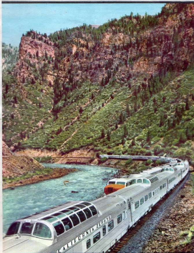
California Zephyr—Glenwood Canyon, Colorado River