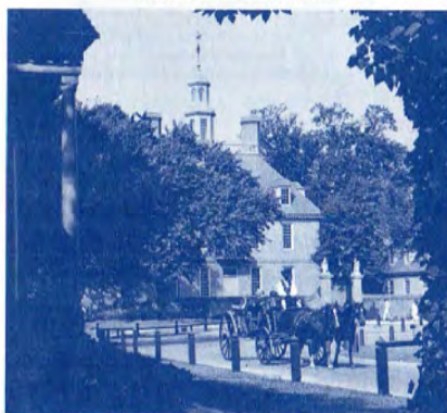
Historic Governor's Palace, Colonial Williamsburg, Va. — a Prime Attraction on Our Lines