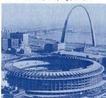
Busch Stadium and Gateway Arch — New Additions to St. Louis Skyline