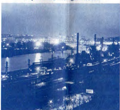
Lighting Up the Night Sky— Steel Mills in Pittsburgh