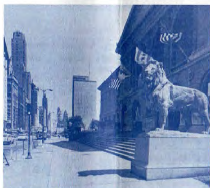
A Chicago Landmark — Lions at Entrance of Art Institute on City's Famed Michigan Avenue