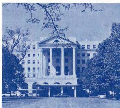
The Greenbrier, C&O's Famous Resort Hotel at White Sulphur Springs, W. Va.