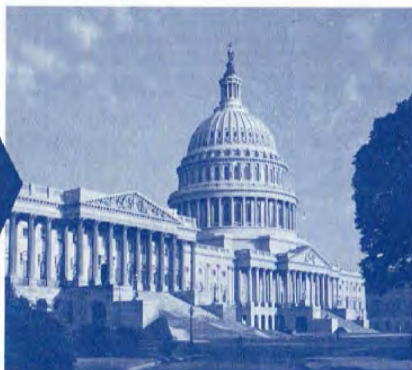
The Capitol —Mecca for Thousands of Tourists