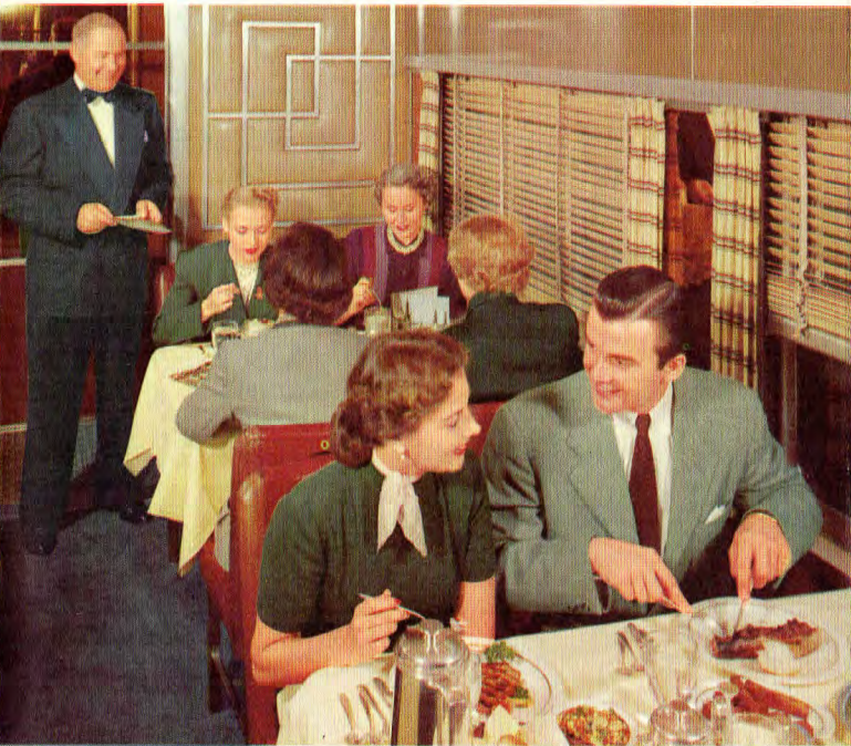
There's a real thrill in the enjoyment of freshly prepared meals in a smartly appointed dining car.