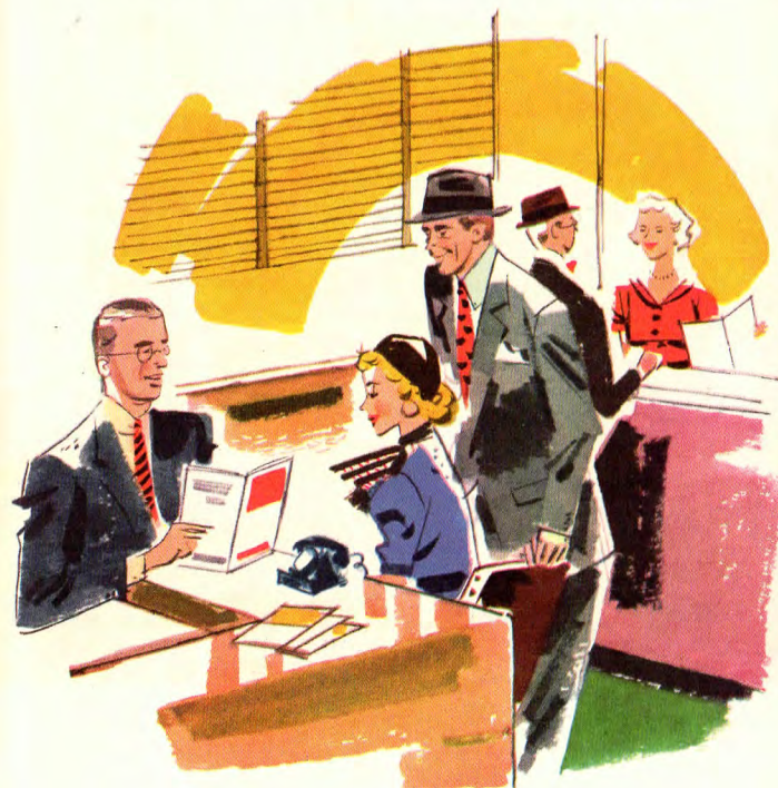
LITHO BY R. M. RIGBY PTG. CO., KANSAS CITY, MO., U. S. A. 11-55

You are cordially invited to phone or visit any Milwaukee Road, Union Pacific or Southern Pacific office for travel information or assistance when planning a trip. Consult your local telephone directory.