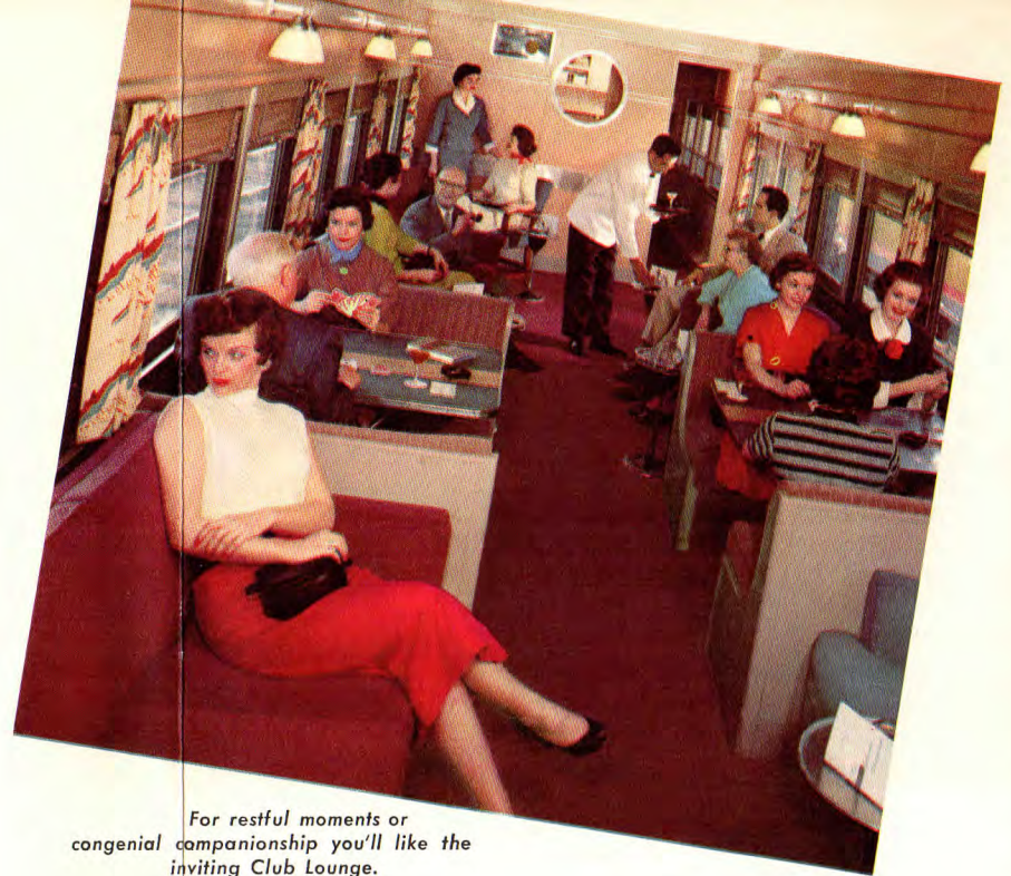
For restful moments or congenial companionship you'll like the inviting Club Lounge.

On the "City of San Francisco" Streamliner there is no extra fare . . . just extra pleasure.