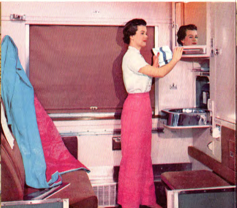
The convenient roomette was designed for economical Pullman travel.