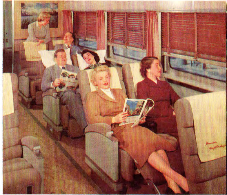
Day and night comfort is provided in Coach seats with stretch-out leg rests and adjustable backs.