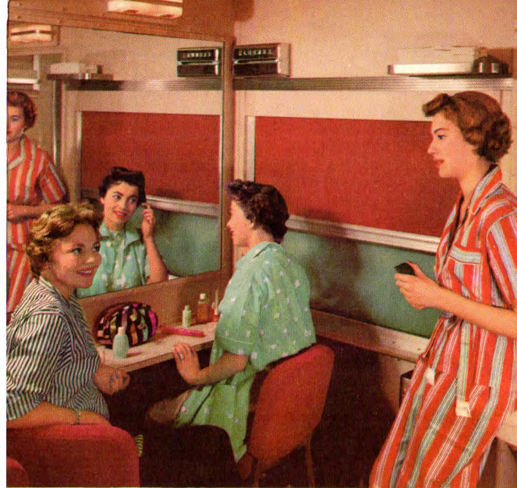
You'll find all the facilities for "freshening-up" in the immaculate rest rooms.

The "City of San Francisco" offers a variety of restful, modern Pullman accommodations including drawing rooms, compartments, bedrooms—single and en suite—roomettes and berths.