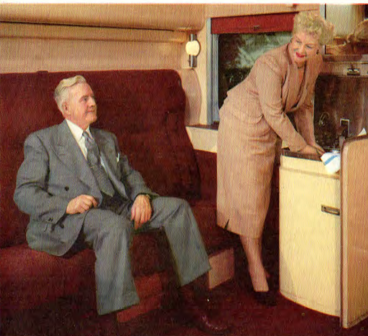
A bedroom or compartment resembles a completely equipped hotel room on wheels.