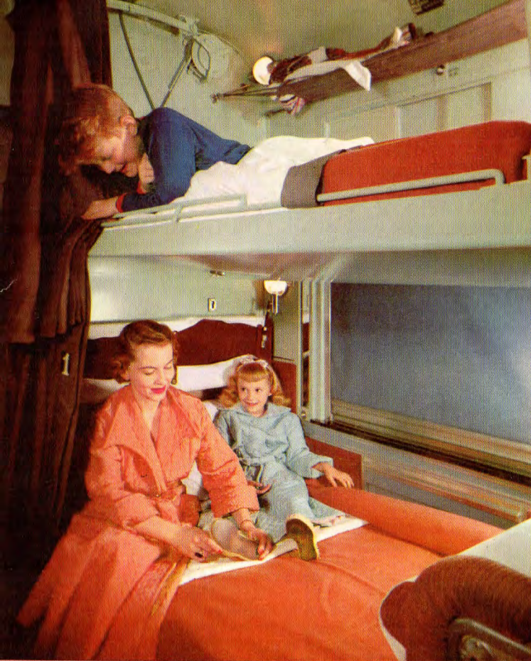
Sound sleep is assured in an attractive Challenger Streamliner section (above) or room.

There are two modern, spacious sleeping cars on The Challenger Streamliner offering a choice of upper and lower berths, roomettes, single bedrooms, and bedrooms en suite for family groups.