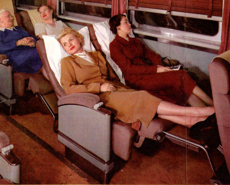
Here's complete down-to-earth comfort in Challenger Streamliner Coach seats. Note the adjustable, reclining backs and the padded pull-out leg-rests for day and night travel.

Particularly pleasing to women are the spacious, immaculate washrooms. They like the smart appointments, large mirrors and restful chairs.