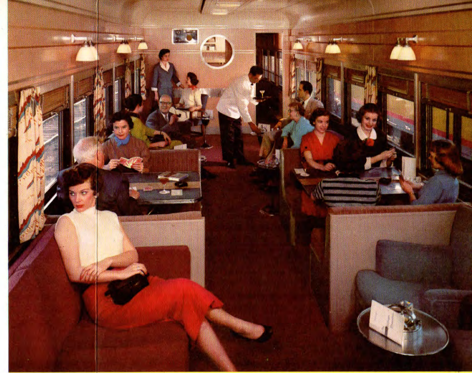
Passengers enjoy this luxurious Club Lounge Car. It is equipped with radio, writing desk and magazines. Refreshments are available.

Both Coach and Pullman occupants can economize by patronizing the main Diner where Challenger low-cost meals are served. All Union Pacific meals are freshly prepared with top quality foods.