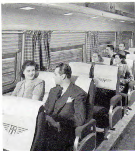
Reclining Seat Chair Car

THE ROOMETTE —A private room designed primarily for one person. The bed is made up before the train leaves and is easily lowered or returned to its place in the wall. The door may be locked, or left open and a curtain drawn across the doorway. Facilities include a fold-away washstand, concealed toilet, luggage space, clothes locker, mirrored cabinet, cool drinking water, individual control of light, ventilation, heat and air-conditioning and a shoe box for the porter.