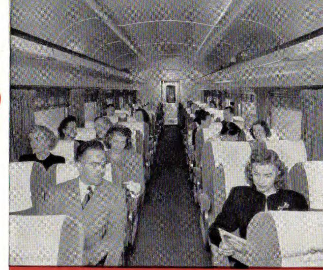
Chair coaches are richly upholstered, colorfully decorated and fully carpeted. Double-width windows afford full view.

The Nebraska Zephyr Is Not An Extra-Fare Train!