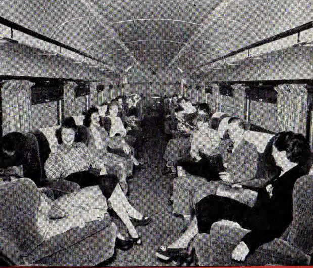
Spaciousness and comfort are the keynotes of the delightful parlor car.