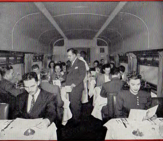
The sparkling beauty of the dining car provides a fitting atmosphere for delicious meals.