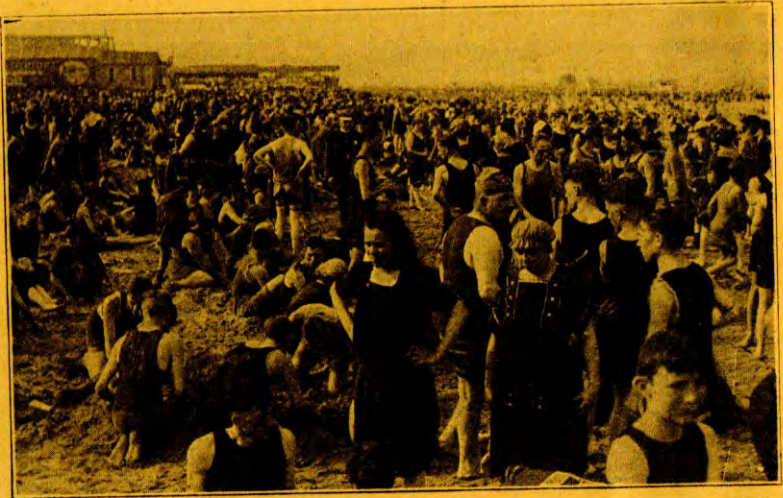
A Busy Day at Clarendon Beach

I N the recent Victory Loan campaign employes on the Elevated Lines formed committees to canvass the roads for