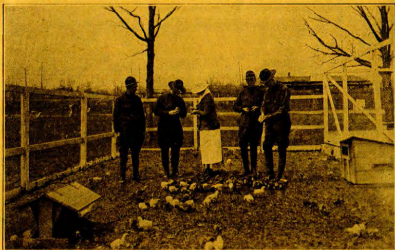
Chicken-raising a Popular Study at Fort Sheridan