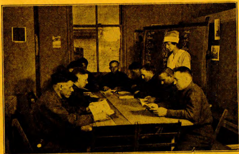
A Class in American History

In cases where the wounded men are unable to leave the hospital wards classes of study are arranged for them in the wards. English for beginners and for-