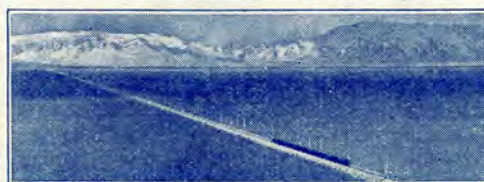
"Going to Sea by Rail" Across Great Salt Lake