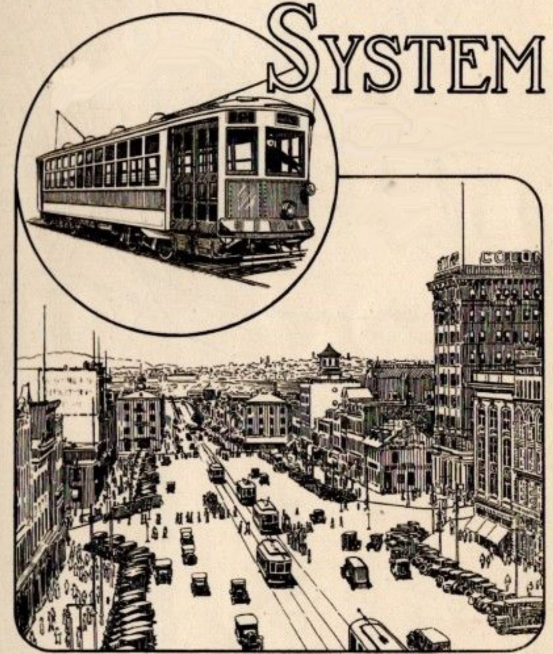
PENN SQUARE Center of Business and Street Railway System

ISSUED BY READING TRANSIT COMPANY 12 SOUTH FIFTH STREET READING, PA.