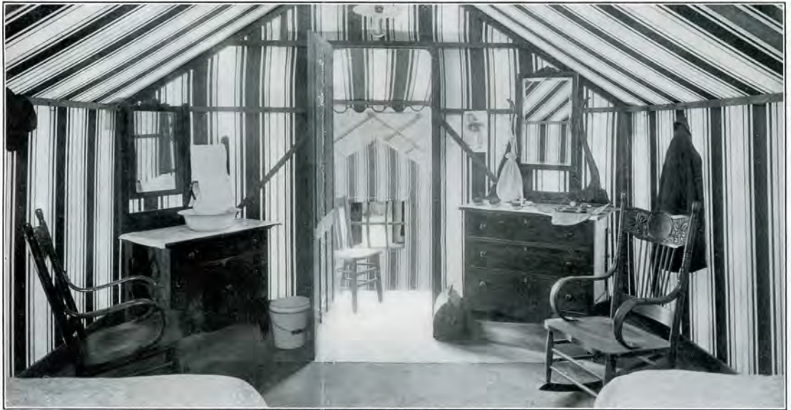
Interior of tents, Noyo River Tavern.

Bungalows with two or three rooms and bath, may also be obtained. They are close to the river, have fire-places, broad verandas, and other conveniences. The Tavern has