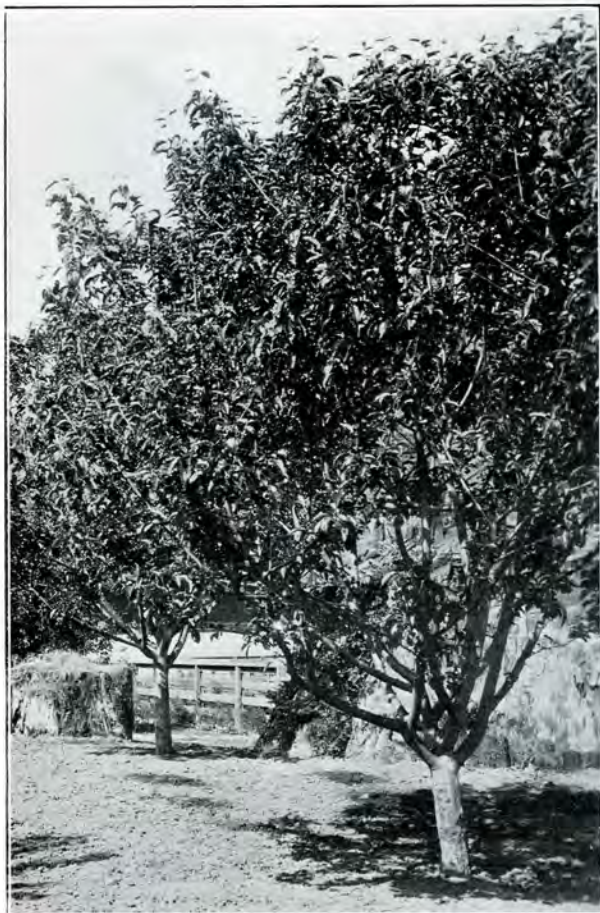
on Noyo River.

ries a complete line of campers' supplies. Within walking distance are many excellent camping places, swimming pools, and choice fishing spots. Hunting is also good. Up the north fork of the river are several small tributaries where trout bite freely.