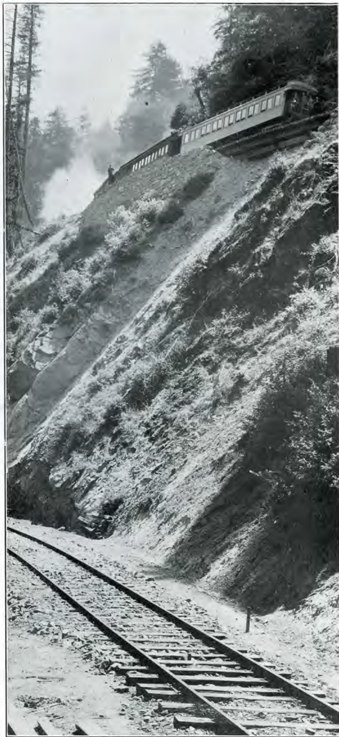
Where one track is almost directly over the track lower down.

The many acres of cut-over redwood land owned by the Union Lumber Company offer an unusual opportunity to secure fertile land at a remarkably low price. The soil is practically all productive and free from alkali, and, due partly to the abun-