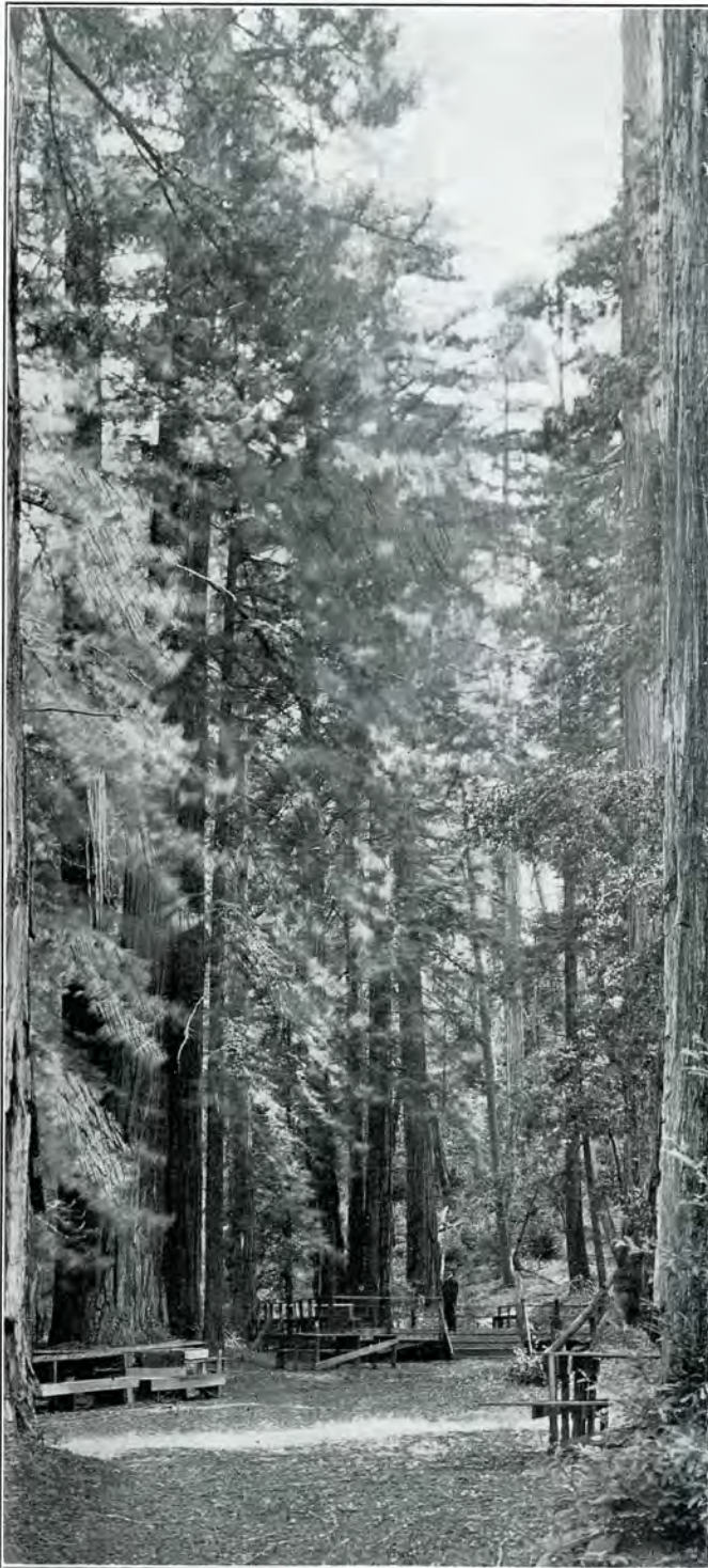
Eagles' Nest, the place for picnics.