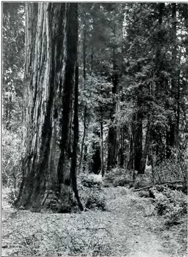
For lovers of nature.

The Noyo River and its branches afford the fisherman great enjoyment and, as the river is stocked every year with a variety of young trout, fishing is always good and the