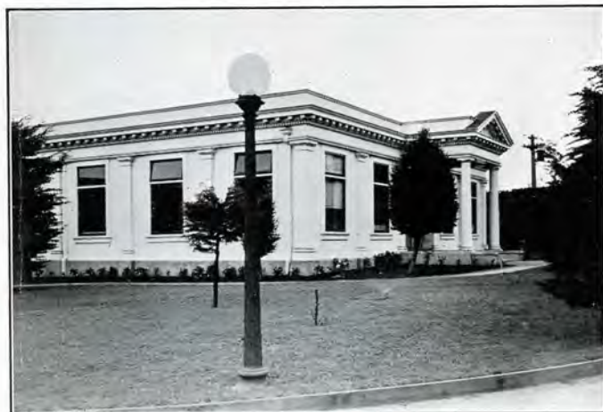
Offices Union Lumber Company at Fort Bragg.