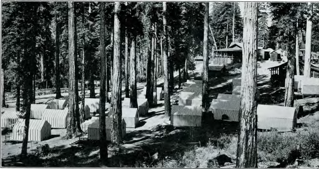
Large, dry tents, with an abundance of cool, fresh air, spiced and tempered by the redwoods

N EAR Northspur, on the banks of the Noyo River, is located the Noyo River Tavern, which today is one of California's most popular resorts. Walking or horse-back riding on the winding trails along the river and over the forest-covered hills, fishing, hunting, swimming, dancing and other amusements, make it an ideal place for outdoor life.