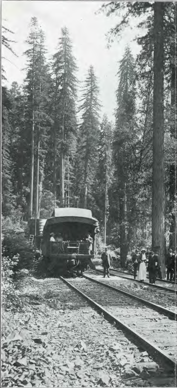
At a spring of pure mountain water.