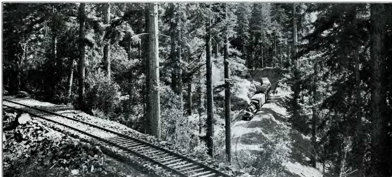
Showing track where to go a mile and a half we travel eight and one-half miles.