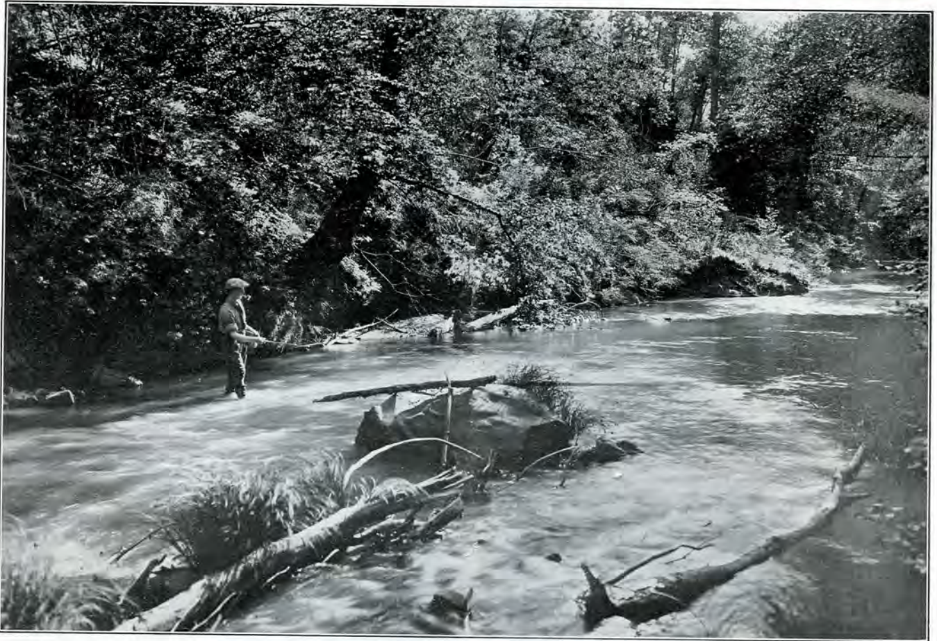
Trout Fishing on the Noyo River.

For a short distance after leaving Willets the train ascends gradually until passing through a tunnel the passenger finds himself 1740 feet above the floor of the canyon through which the Noyo River flows. Descending the side of the canyon the beautiful Noyo River is finally reached, the train winding back and forth so that in places the track curves almost directly over the track below, forming a continuous letter "S." At one place it is necessary to travel eight and one-half miles to cover a distance of a mile and a half.