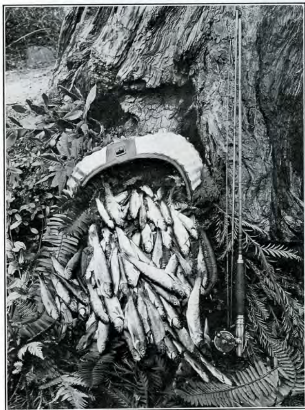
Trout caught near Noyo River Tavern.

beautiful, being heavily wooded on both sides, with strips of gravel and sand along its banks, where fishermen can find joy and contentment and where trout lurk in the shadows of every pool. The combination of river and redwood trees, with the surrounding hills of perpetual green, make a picture hard to describe. Nothing grander than the scenery at this point on the Noyo River can be imagined and Eagles' Nest must be seen to be appreciated. Parties desiring to enjoy the beauties and conveniences of Eagles' Nest can make arrangements by applying to the California Western Railroad and Navigation Company at Fort Bragg or San Francisco.