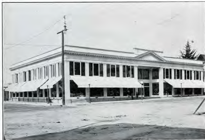
Union Lumber Company's department store at Fort Bragg.