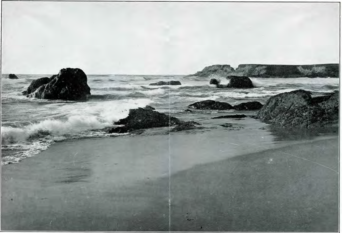
Coast at Fort Bragg.

dance of water, and partly to the effect of ages of fertilization by the forests, is highly fertile. It is in general a sandy loam of great depth, resting on a clay sub-soil, which retains moisture, making irrigation unnecessary. The equable climate of this region is another factor favoring agriculture.