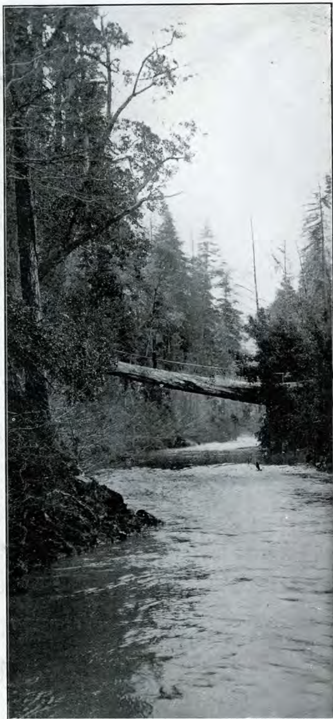
Noyo River at Eagles' Nest.