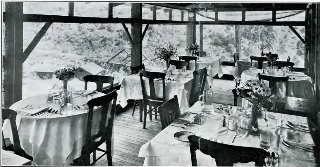
Tables on screened veranda, Noyo River Tavern.

For further information or reservations, address Noyo River Tavern, Northspur, Mendocino County, Cal.