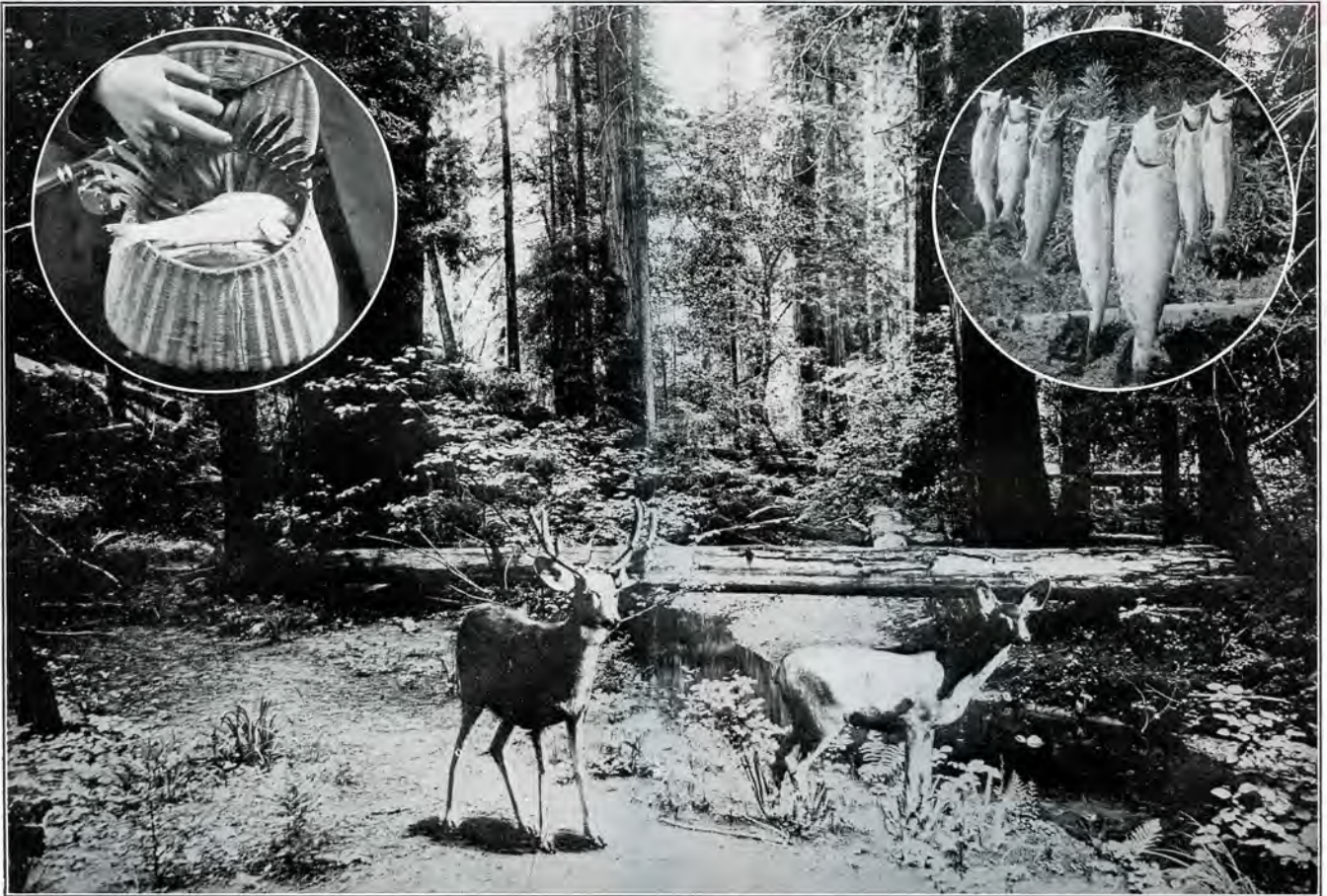
Fish and game are plentiful along the Noyo River.