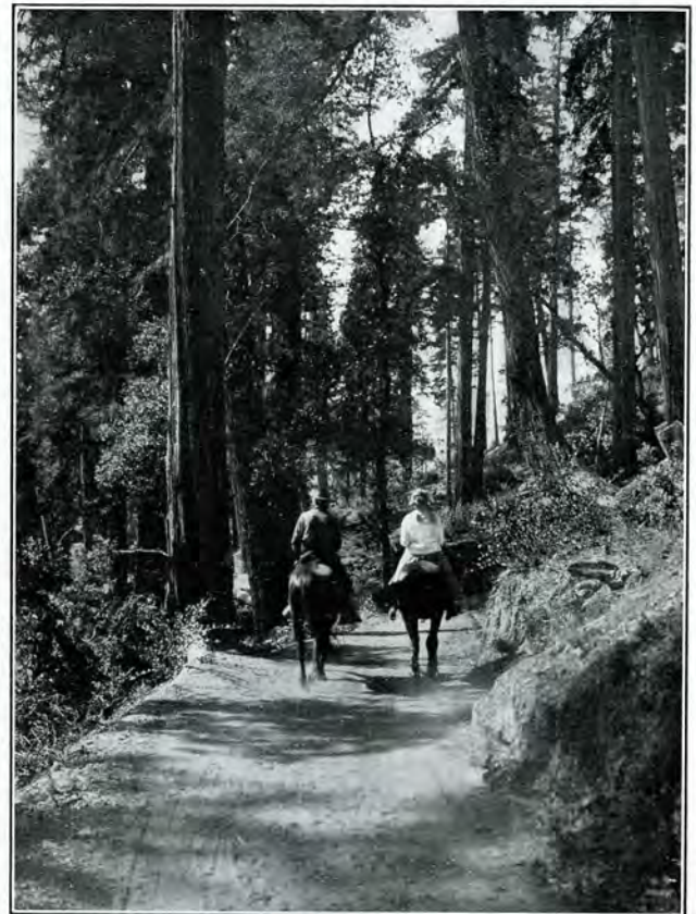
Road through woods near Noyo River Tavern.