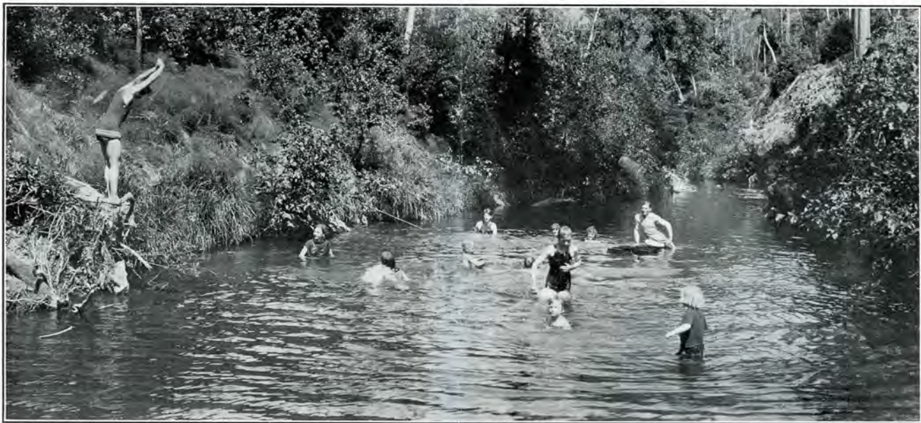
Swimming pool, Noyo River Tavern.

one to look forward to with keen anticipation.