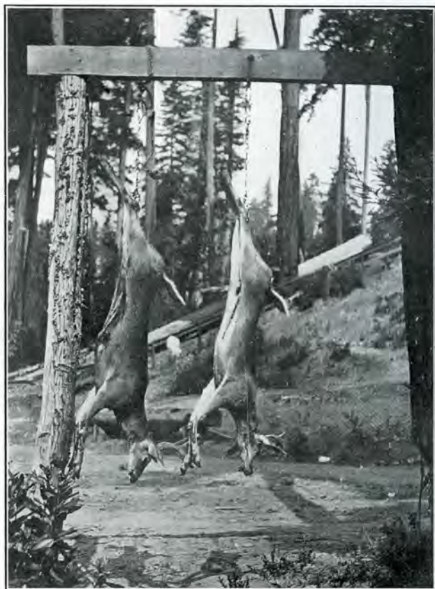
Deer killed near Noyo River Tavern.

fisherman finds his sport pleasantly spiced. The deep fastness of the forest, beside its scenic beauty and primitive grandeur, makes the hunter feel that he is breaking a new trail, and where the land has been logged off, the brush-covered hills make deer hunting famous. Deer are plentiful, bear are still to be found, wildeat not uncommon, and other fur animals make the hunter's life a happy one. Mountain and valley quail, squirrels and other small game are plentiful all through the Noyo River country. Wild duck and geese are abundant along the coast and deep-sea fishing is a regular pastime at Fort Bragg.