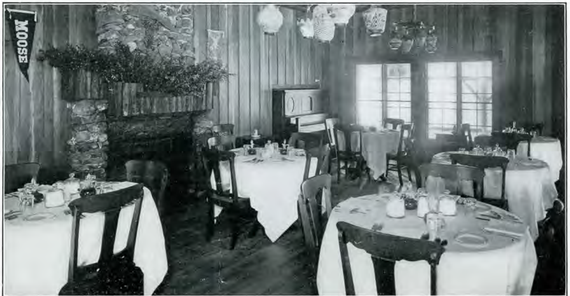
Section of dining room, Noyo River Tavern.

Around these central buildings are the tents. Each of these tents is built on a raised platform with a covered floor, and is furnished with two beds—one full size and the other three-quarter; good springs and