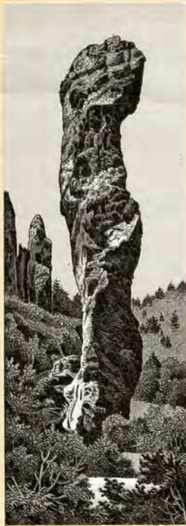
MAJOR DOMO 'GLEN EYRIE.'