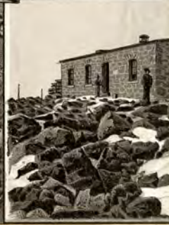
SUMMIT OF PIKE'S PEAK, A