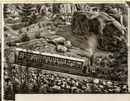
CLIMBING TO PIKE'S PEAK.