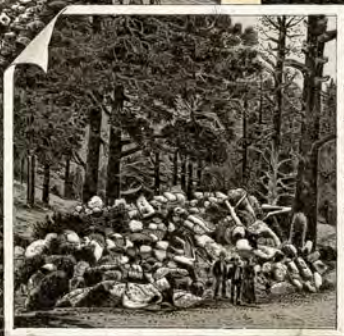
THE GRAVE OF MRS. HELEN HUNT JACKSON, CHEYENNE MOUNTAIN. UTE PASS & RAINBOW FALLS. SEVEN FALLS, CHEYENNE CAÑON.