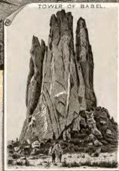
TOWER OF BABEL.