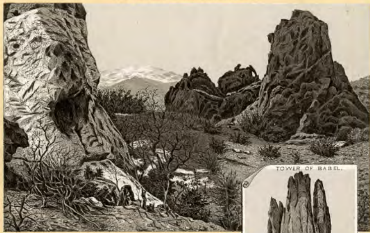
SEAL & BEAR, GARDEN OF THE GODS.