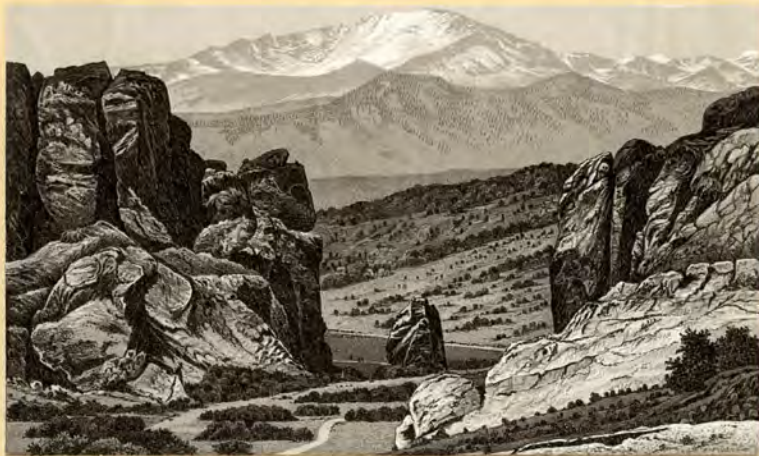
GATEWAY TO THE GARDEN OF THE GODS & PIKE'S PEAK.