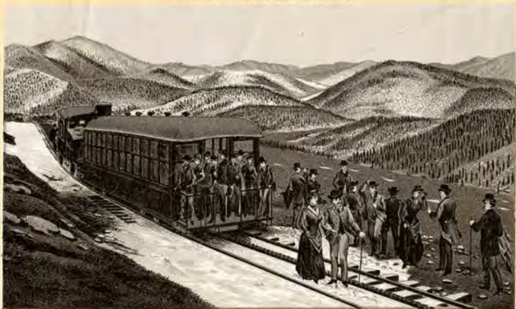
LOOKING SOUTH FROM WINDY POINT.