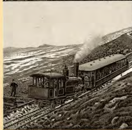
NEARING THE SUMMIT OF PIKE'S PEAK.