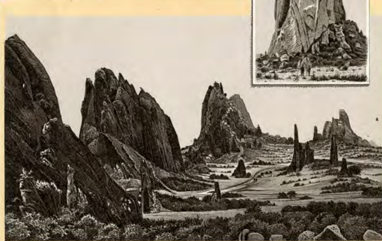
GARDEN OF THE GODS, INTERIOR VIEW.