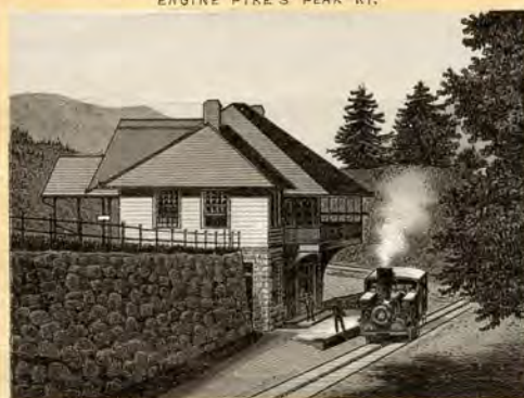
MANITOU STATION, PIKE'S PEAK RY.