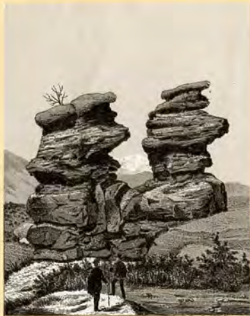
SIAMESE TWINS, GARDEN OF THE GODS.