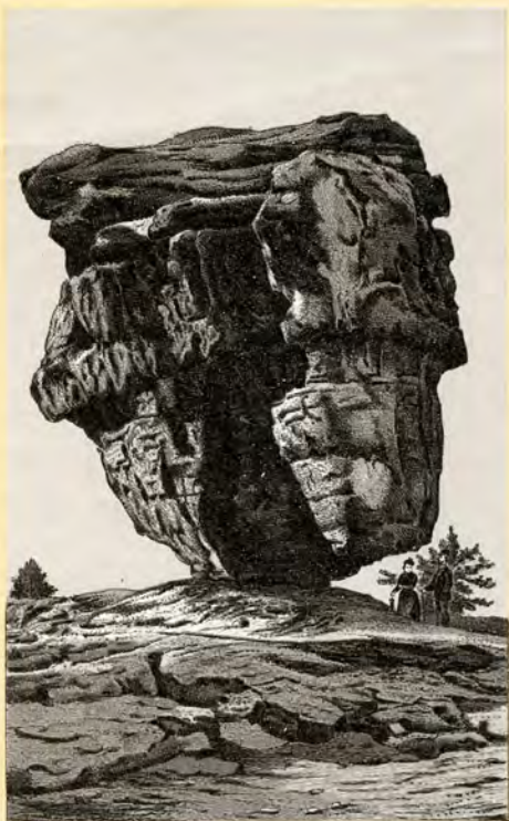
BALANCED ROCK, GARDEN OF THE GODS.