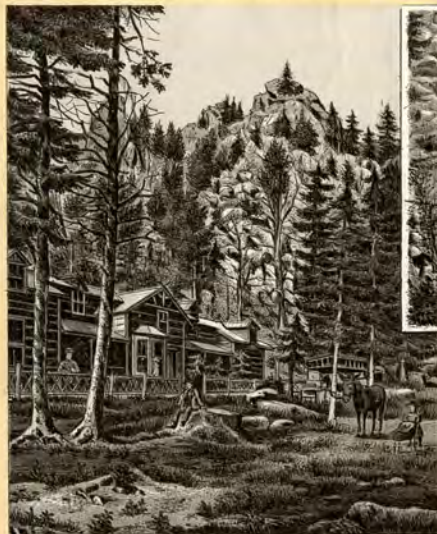
HALF-WAY HOUSE P.P. RY. AND TRAIL.