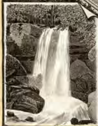
MIRNERAHA FALLS. ASCENDING PIKE'S PEAK BY RAILWAY.