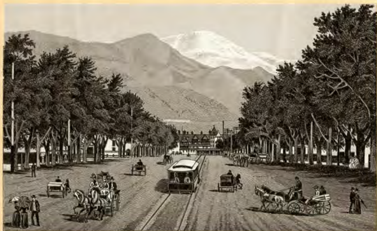
PIKE'S PEAK AVENUE, COLORADO SPRINGS.