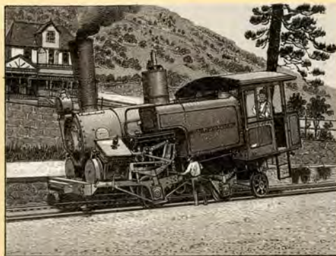
ENGINE PIKE'S PEAK RY.