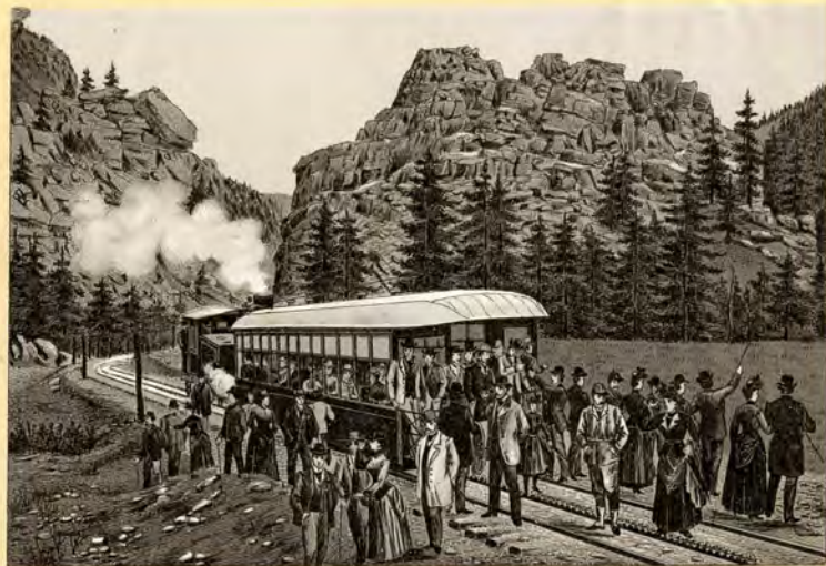
HELL-GATE, PIKE'S PEAK RY.