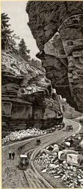
THE NARROWS 'WILLIAM'S CAÑON.'