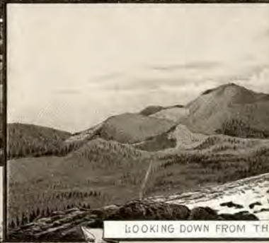
LOOKING DOWN FROM THE