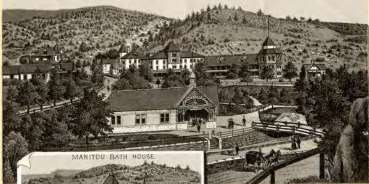
MANITOU BATH HOUSE.