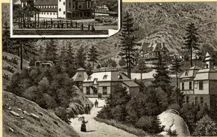
IRON SPRING & HOTEL.