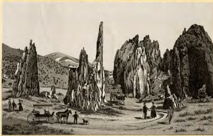
CATHEDRAL SPIRES, GARDEN OF THE GODS.