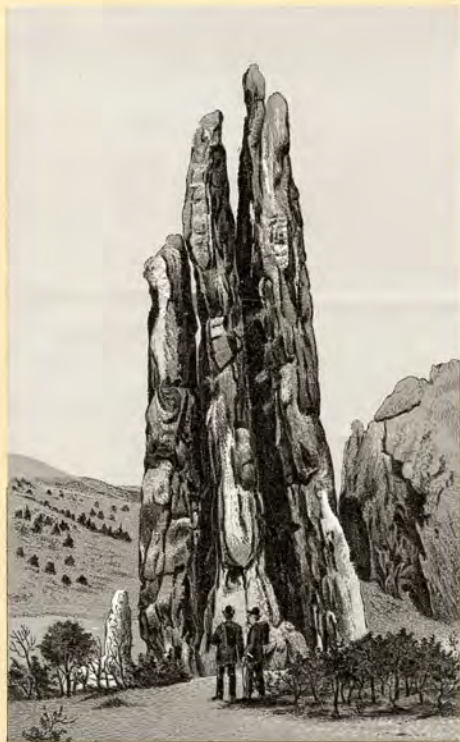
THE THREE GRACES, GARDEN OF THE GODS.