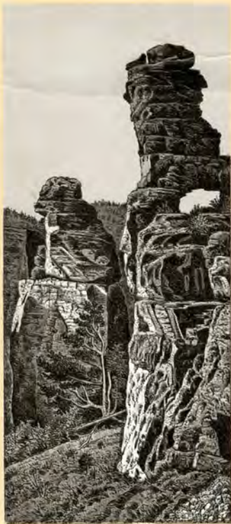
TEMPLE OF ISIS.