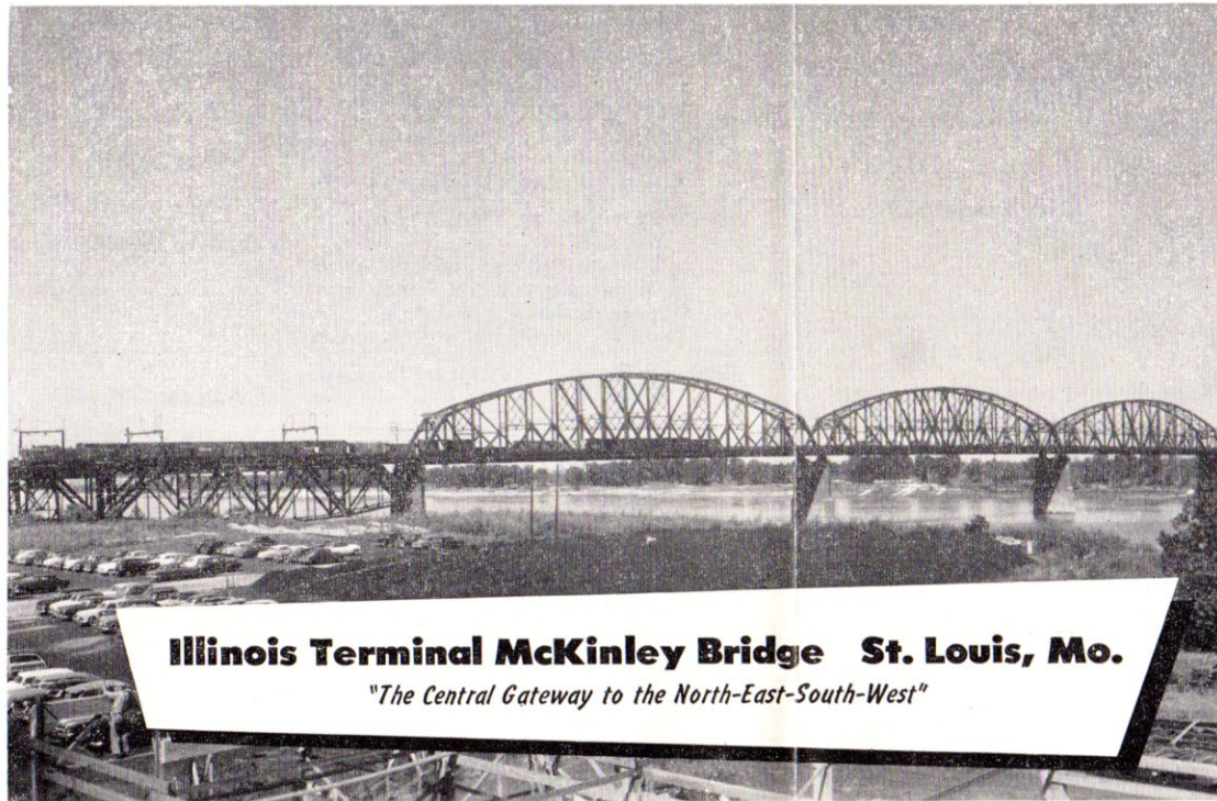
Illinois Terminal McKinley Bridge St. Louis, Mo.

Trains are operated on Central Standard Time.