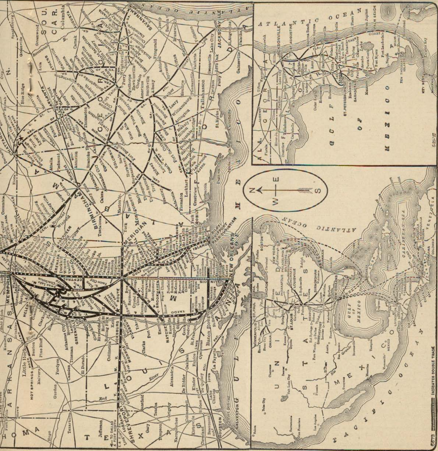
Only one coupon reading "Illinois Central System," required between any two points on Illinois Central, The Yazoo and Mississippi Valley and Gulf and Ship Island Railroads.