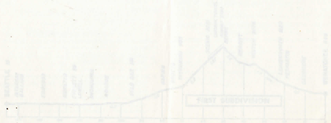
RAILROAD TRACKS—ELEVATION DATA—STATIONS & MILEAGE—SPEED TABLE—STATION & MILEAGE—STATION & MILEAGE