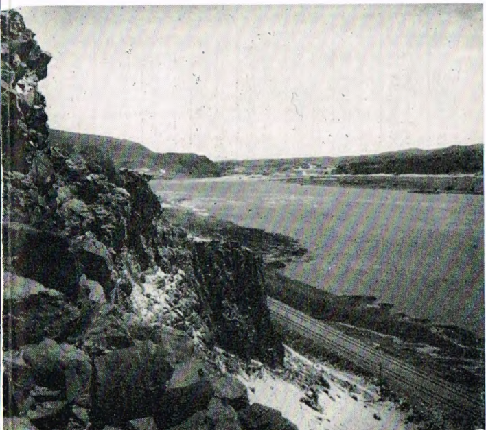
Columbia River—near Wishram, Wash. on S.P. & S.Ry. main line.

Your Choice of... Three Daily Trains Between PORTLAND and SPOKANE