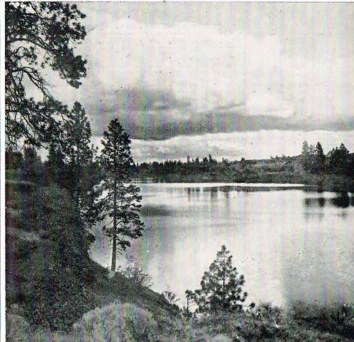
Amber Lake—thirty miles west of Spokane on S.P. & S.Ry. main line.