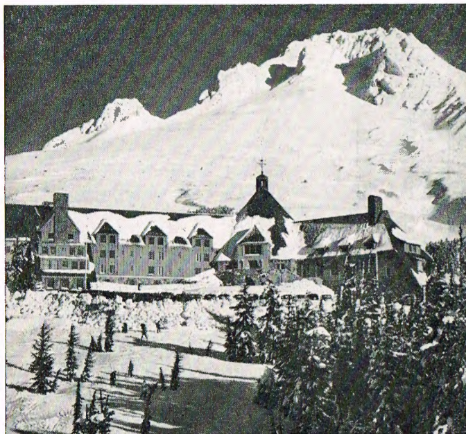
Mt. Hood (11,245 ft.) and Timberline Lodge at the 6000 foot level. Reached by short motor trip or by sight seeing buses from Portland, Oregon. Ski-lift showing above center of lodge extends one mile to 7000 foot level.

S. P. & S. RY.—OREGON TRUNK RY.—OREGON ELECTRIC RY.—(Subsidiaries of Northern Pacific and Great Northern Railways)