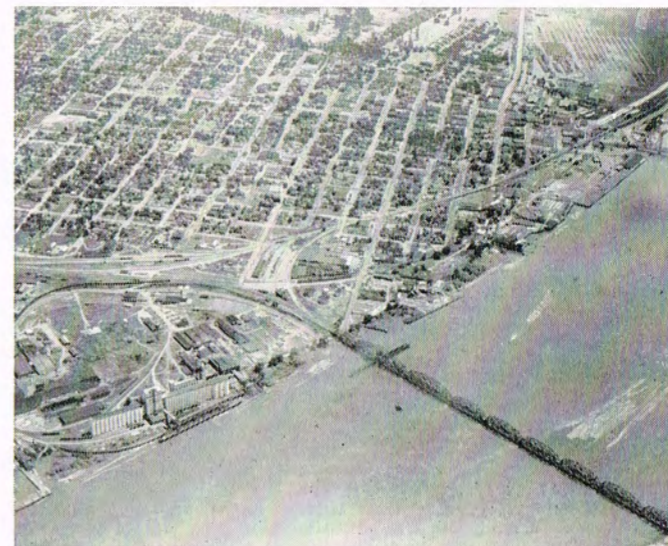
Airplane view of Vancouver, Washington and S.P. & S. bridge across Columbia River

S. P. & S. RY.—OREGON TRUNK RY.—OREGON ELECTRIC RY.—(Subsidiaries of Northern Pacific and Great Northern Railways)