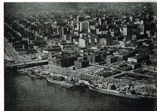
Portland—the Rose City