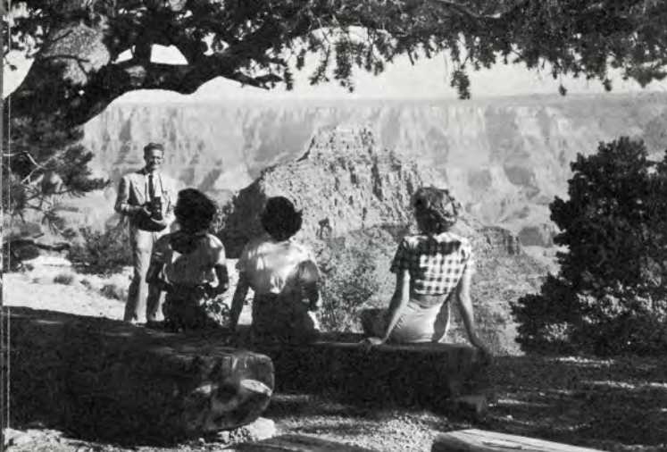
GRAND CANYON, ARIZONA