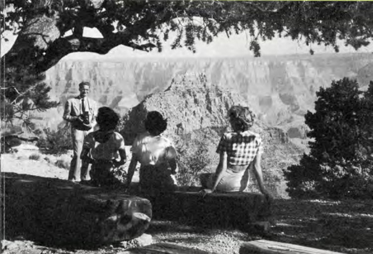
GRAND CANYON, ARIZONA